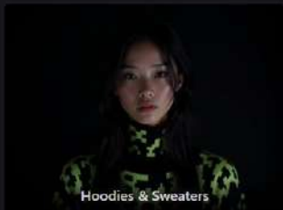
Hoodies & Sweaters