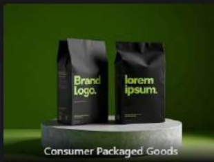
Consumer Packaged Goods