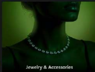
Jewelry & Accessories